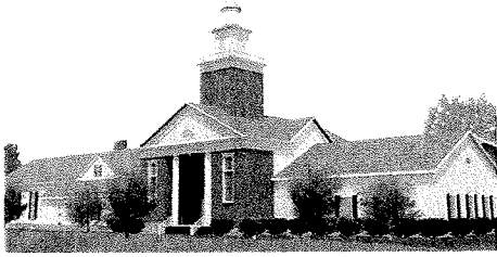
Bruce G. Rinker Mayor