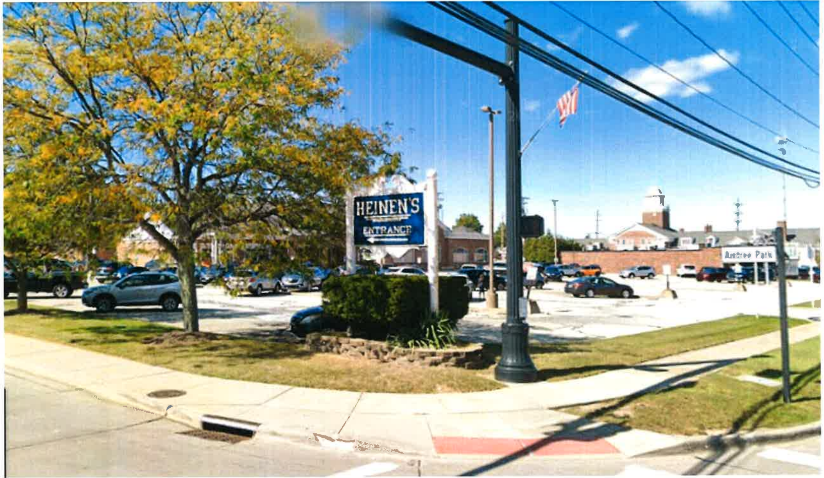
Heinen's sign there now